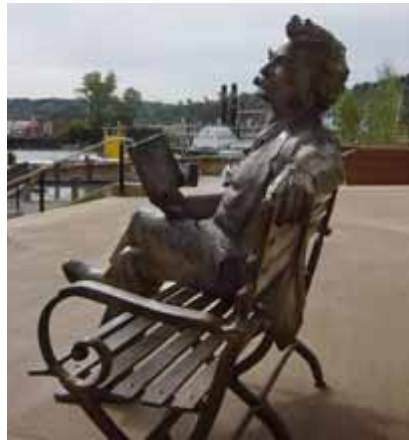
A sculpture of Samuel Clemens as 'Mark Twain' gazes over his beloved river at the Mississippi River Museum and Aquarium.

An hour-long narrated tour via Trolleys of Dubuque covers the city's historic section and provides an alternative way to get to the top of the bluffs. With hop-on and hop-off service, riders can walk or ride from downtown to America's River, a tourism development set on the banks of the Mississippi.