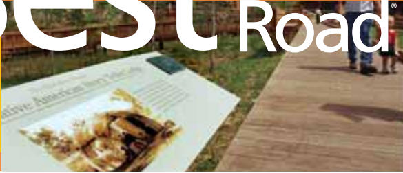
The Mississippi River Museum and Aquarium in Dubuque, IA, includes a number of outdoor areas.

For a road trip as relaxing as a Sunday afternoon drive, start your engine in Dubuque, IA, and follow the Great River Road to Saint Paul, MN. Thanks to a glacial detour, this part of northern Iowa, western Wisconsin, and eastern Minnesota boasts a landscape replete with rolling countryside, dense wetlands, and towering bluffs. By following road signs identified by a river pilot's wheel, the Great River Road leads to one charming river town after another. Catfish, cheese curds, and seismic chimes are all here in the Editor's Picks, shown in bold, our way of sharing with you those special things we call "Best of the Road."