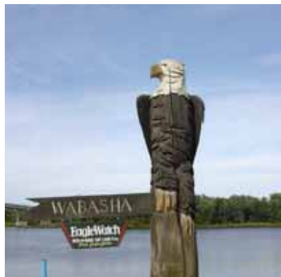
Visitors can spot eagles all year long from the Eagle Watch platform in Wabasha, MN.

Continuing north, the Great River Road curves along flat lowland, then stretches east toward the river into Wabasha. The confluence of the Mississippi and Chippewa rivers is located at Wabasha, and the force from the two rivers is so great that the water never freezes. That's lucky for the bald eagles that are able to overwinter – luckier still for residents, as eagle sightings are part of everyday life. The experts at the National Eagle Center report that eagles are partial to cottonwood trees when building a nest. Tree height and branch strength are important because eagles return to the same nest, repairing and enlarging it, year after year.