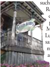
Many vintage buildings in Dubuque have been transformed into boutiques.

Private homes aren't the only structures being restored in Dubuque. Much of downtown has been converted into trendy shops and eateries, such as The Pepper Sprout Midwest Cuisine Restaurant, which shows off its 19th-century façade with purple paint and green trim. Just down the street is Café Manna Java, also in a restored storefront. Luncheon menu favorite: Hot panini sandwich served with a choice of homemade sauces, like the béchamel made for a croque monsieur at $7.25. Café Manna Java sandwiches, like chicken pesto or sprouts on grain ($7.25 each), are served "Dubuque Riverfront style," meaning with a side of slaw made with red cabbage chiffonade.