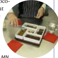
Chocolat Celeste in Saint Paul, MN offers chocolate tastings and pairings.

About two miles further west on University is Chocolat Celeste, an exclusive chocolatier that specializes in handcrafted grand truffles. Grand truffles are a full ounce of chocolate-covered ganache (filling). A Celestial Sweetie, one of the shop's signatures, is filled with pure bittersweet chocolate ganache. Throughout the year, Chocolat Celeste schedules chocolate and wine pairings during which the nuances of fine chocolate are discussed, then savored with fine wine.