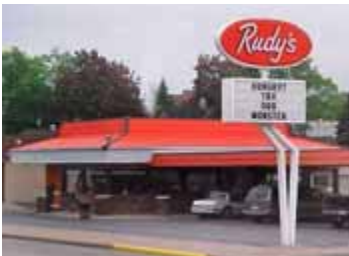
Rudy's, the largest drive-in in the Midwest, is located in La Crosse, WI.

The height of the bluffs along the Mississippi peaks at La Crosse, stretching to more than 500 feet at Granddad Bluff. Granddad's is a terrific spot to look over the city, back at Iowa, and into Minnesota. On the way to the look-out, it's difficult to miss Rudy's Drive-In ; it is the largest in the Midwest. Rudy's has been making and selling root beer for three generations. The red hots are boiled hot dogs served as you like them and delivered to the driver's side window by roller-skating waitresses.