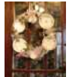
Tea and tea accessories are offered at the Tale of Two Sisters Tea Room and Gift Shoppe in Red Wing, MN.

One of the town's treasures is the Tale of Two Sisters Tea Room and Gift Shoppe , where tea and its accoutrements are served in one of Red Wing's historic homes. There's shopping at the tea-room, too: trimmings for the table, accessories for the home, and a selection of choice teas including several cut exclusively for the two sisters.