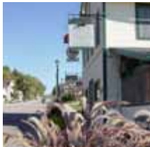
The restaurant at the Trempealeau Hotel in Trempealeau, WI, specializes in vegetarian dishes.

The drive between La Crosse and Trempealeau alternates between wide-open spaces and canyon-like passes with bluffs encroaching on both sides of the river. The restored-to-period downtown stretches about four blocks before reaching the river. The Trempealeau Hotel, a wooden clapboard building, offers guestrooms with or without facilities. Its kitchen serves a veggie burger made with ground walnuts, which patrons can enjoy in the dining room or outside on a broad expanse of lawn overlooking the river.