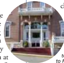
The St. James Hotel continues to welcome guests to Red Wing, MN.

While in Winona, do as the college crowds do and grab a bite to eat at the Jefferson Pub and Grill, located along the railroad tracks. Because it is a favorite meeting place, reservations may be required when an event is going on at Minnesota State College, Winona State University, or St. Mary's University of Minnesota, all located within the city limits. Jefferson's offers world-class burgers of both beef and vegetarian variety. The veggie burger is made with black beans ($6.50) and provides a bit of heat in every bite.